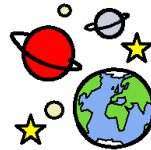
the world and the universe